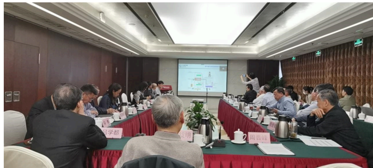
与中国绿发会合作在中国科技会堂召开“协同减碳降污，共创冬奥蓝天”专家座谈会 Winter Olympics air quality seminar co-hosted with CBCGDF at China Hall of Science and Technology