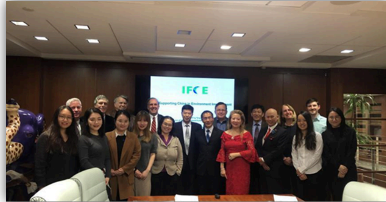
2020年 IFCE 新年招待会，部分理事，华盛顿办公室职员 与来宾合影

IFCE submitted written recommendations to China's Ministry of Ecology and Environment to strengthen control over "colored smoke emissions and ammonia discharge."