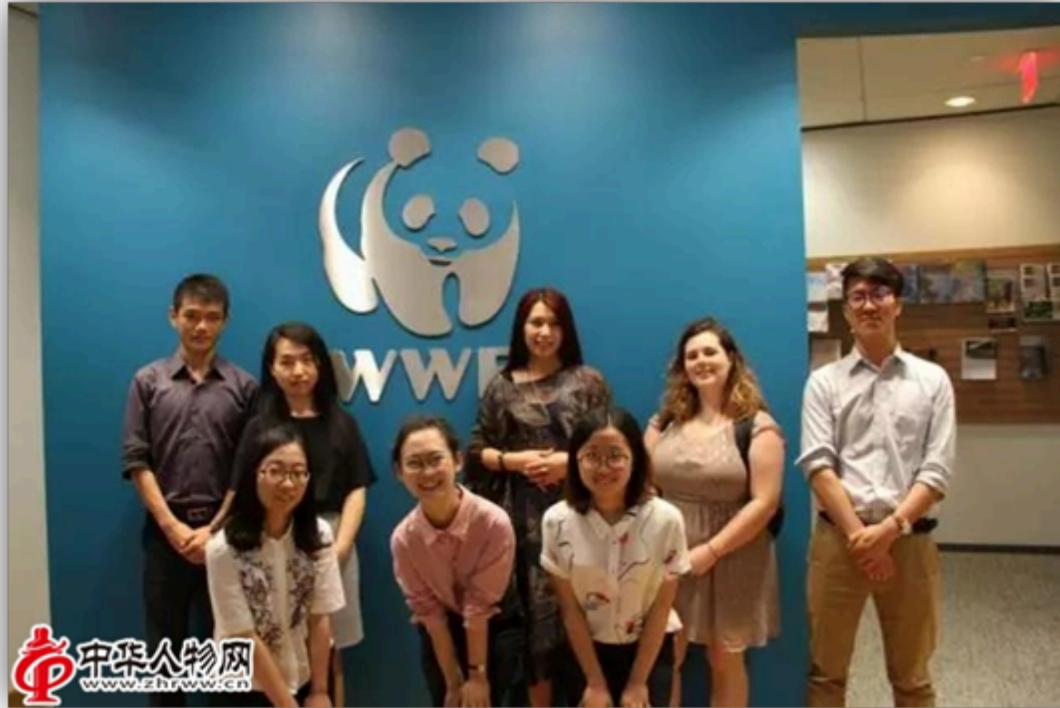
IFCE基金会组织中国“未来绿色领袖训练营”在 WWF-US 访问

IFCE organized a visit to WWF-US for China's "Future Green Leaders Training Camp."