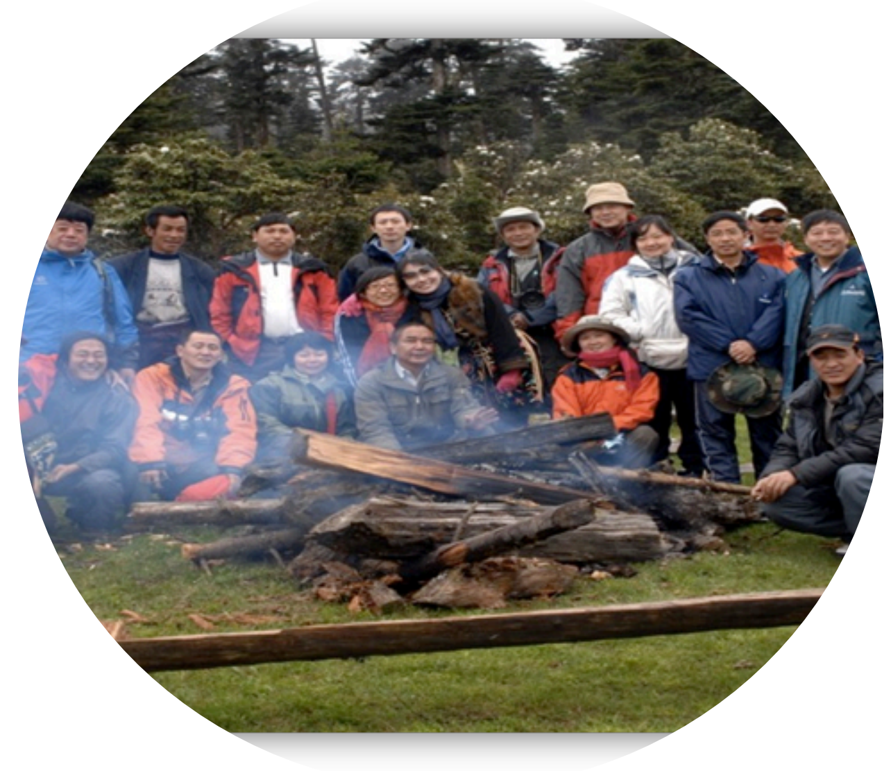
In 2008, the Yunnan Scientific Expedition Team, supported by IFCE, conducted a field research of the 'Three Parallel Rivers' World Heritage Site protection at Qianhu Mountain in Yunnan, and proposed policy recommendations.